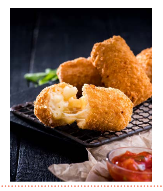
PARAMOUNT Macaroni Cheese Croquettes

Pack Size: 50 x 47g Product Code: 4010800121