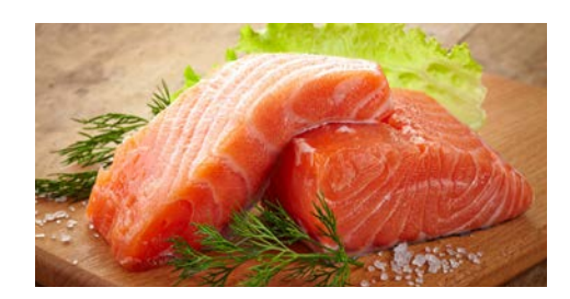
KB'S Salmon Portion Skinless

Size: 200g Skin On Size: 200g Skin On Scaled