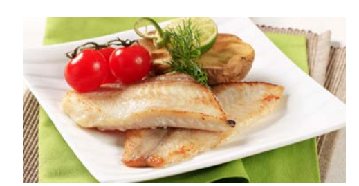
ALPHA Nile Perch Fillet Skinless

Product Code: 1010202566 Size: 100-200g Product Code: 1010202231 Size: 200-300g Product Code: 1010202233 Size: 300-500g Product Code: 1010202234 Size: 300-500g