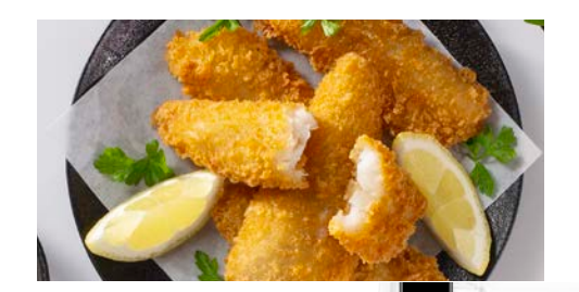
KB'S Australian Whiting Panko Crumbed (Pre-Fried)

Pack Size: 50 x 47g Product Code: 4010800121