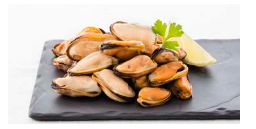
JUST CAUGHT Mussel Meat Cooked