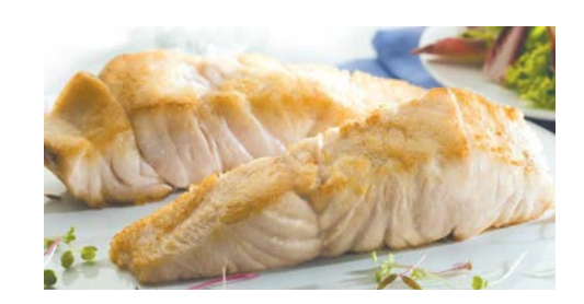
KB'S Barramundi Fillet Skinless