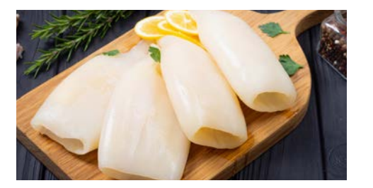
JUST CAUGHT Gigas Squid Tube Super Tender

Pack Size: 10 x 1kg Product Code: 1010300537