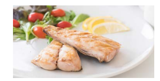
JUST CAUGHT Spanish Mackerel Fillet Skin On

Product Code: 1010202423 Size: 100-200g Product Code: 1010202549 Size: 200-300g Product Code: 1010202550 Size: 300-500g