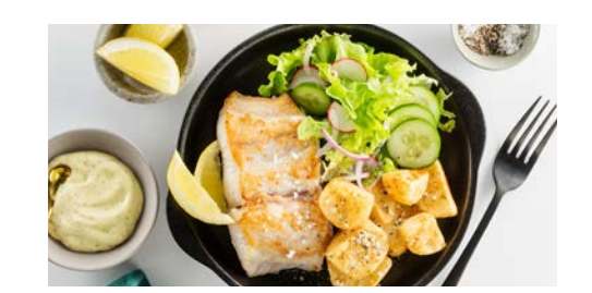
JUST CAUGHT Goldband Snapper Fillet Skin On

Product Code: 1010202465 Size: 100-200g Product Code: 1010202231 Size: 200-300g Product Code: 1010202422 Size: 300-500g Product Code: 1010202548 Size: 500-800g