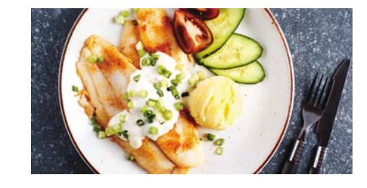
KB'S Basa Fillet Skinless (ASC)