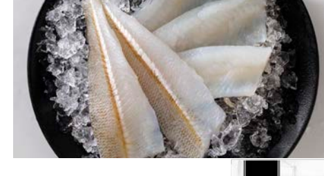
KB'S Australian Whiting Natural

Pack Size: 10 x 400g Product Code: 1010202811