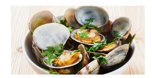
STARPAK Clam Whole Cooked

Pack Size: 10 x 1kg Product Code: 1010300621