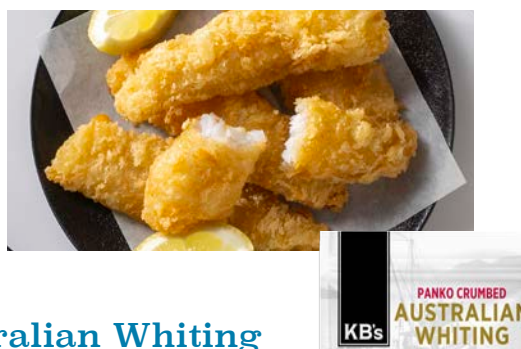
Australian Whiting Panko Crumbed

Pack Size: 10 x 1kg Product Code: 4012100079